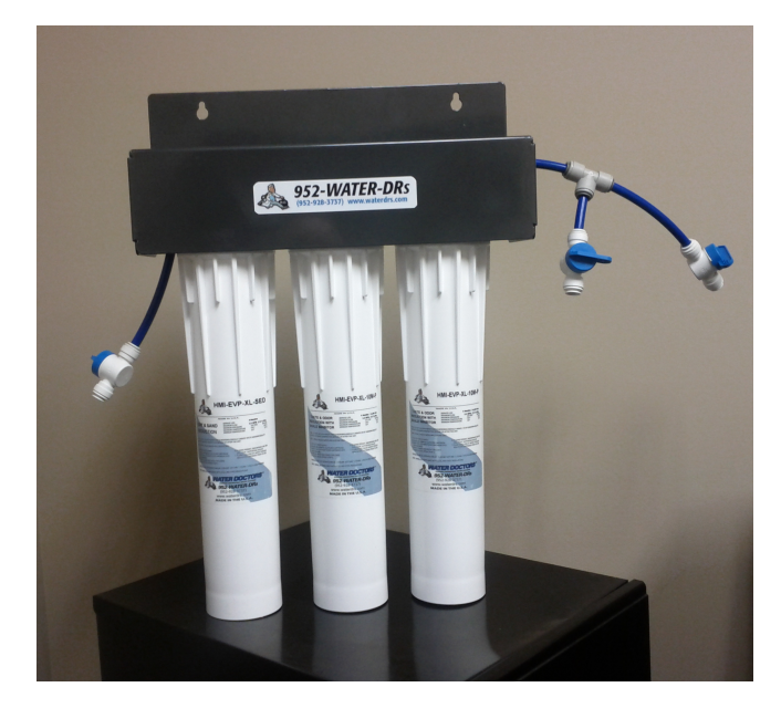
*REMINDER: Prior to turning water on onto the machine, be sure to flush the filters in order to release carbon fines. If this is not done, the unit WILL NOT FUNCTION PROPERLY.