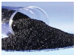
High performance micropore steam-washed coconut-shell carbon