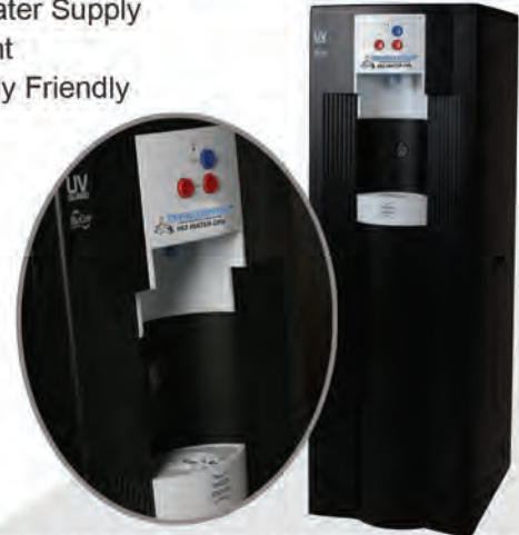
15.25"W (38.7cm) x 17.5"D (44.5cm) x 45.5"H (115.6cm)